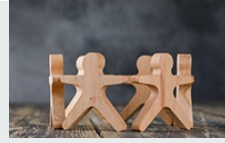
Alumni evening 26th February