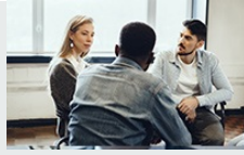
Samaritans meet 12th February