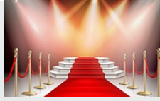
Alumni award night Coming soon